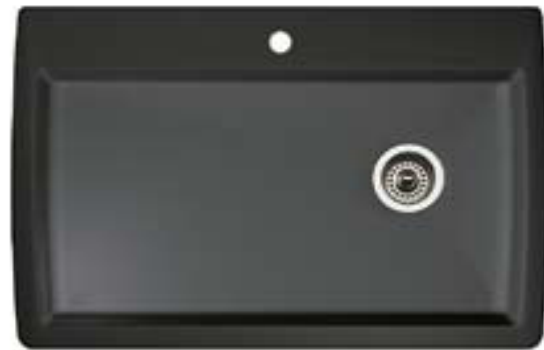
Model 440194 shown